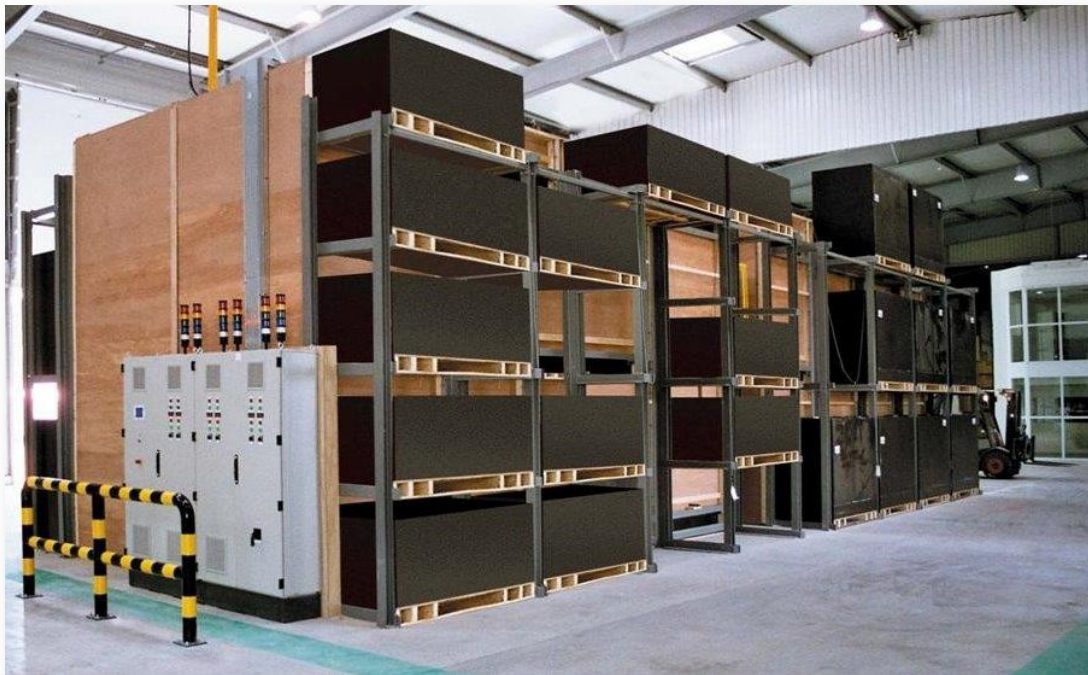
Drying each box individually to the desired moisture content of the seed.