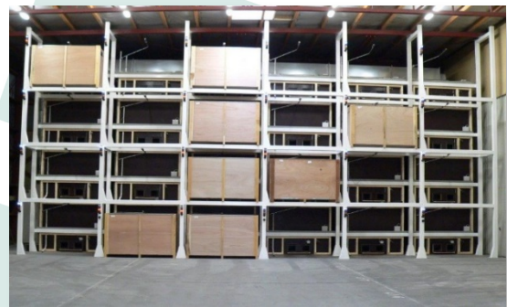
Installation partly filled with boxes