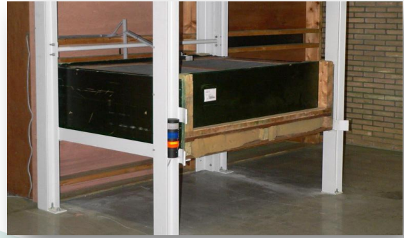
LED-lamps for indication status of drying.