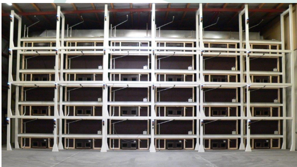
Example installation without boxes