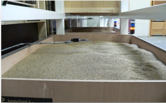
Measuring air out of seed per box to control.